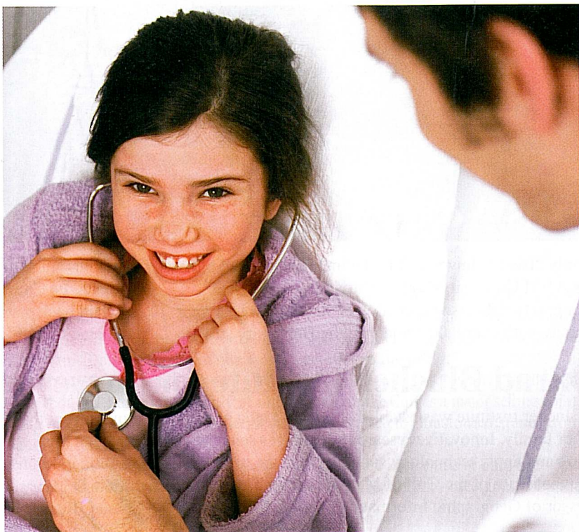
Driscoll treats children from birth through age 21 from all over South Texas.