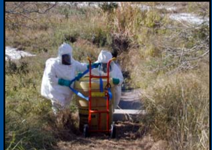
Level A Hazmat response exercise near Oso Bay

Due to the requirements for spill response exercises evolving out of the Oil Pollution Act of 1990, various state laws and international regulations, the School is actively involved in developing response plans and designing and conducting on-site spill response exercises for a number of organizations throughout the country. Since 2001, we have incorporated GPS, GIS and digital imagery into our Spill Management Team and Response drills and exercises.