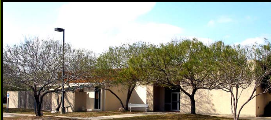
The Conrad Blucher Institute for Surveying and Science Building at the Texas A&M University-Corpus Christi Campus

The Conrad Blucher Institute for Surveying and Science (CBI) was established in 1987 by a private endowment from the Conrad Blucher family. The Institute encourages scientific research and education, with a special emphasis on surveying via the Geographic Information Science Program in the College of Science & Technology. The CBI conducts innovative research and encourages scientists and professional engineers to develop and apply technology solutions relevant to surveying, scientific measurements, and to the issues in the Gulf of Mexico region.