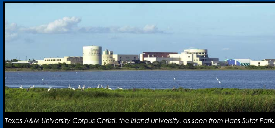
Texas A&M University–Corpus Christi, the island university, as seen from Hans Suter Park.

Undergraduate programs prepare students for productive careers in their chosen fields and provide them with the intellectual, cultural and ethical foundations necessary to contribute effectively and positively to a changing global community. Graduate programs prepare students for leadership roles in the future development of the region and state through formal instruction and through research and other forms of scholarly activity. A&M–Corpus Christi emphasizes research endeavors that focus on solving problems related to South Texas urban and coastal regions.