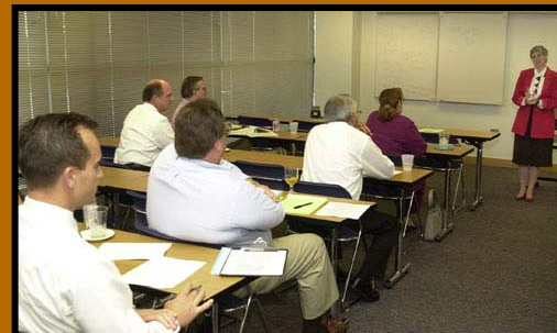
Customized training programs enhance local workforce skills.

Youth Programs: Programs for children ages 7-18 interested in topics from writing to sports to environmental education