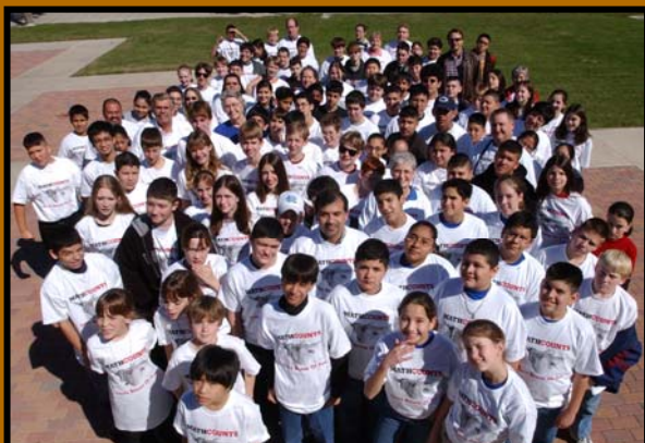
All of the 2005 MathCounts participants and their coaches.

The Office of Community Outreach builds successful community-University partnerships and programs serving a diverse group of citizens and organizations. Outreach staff also participate in a number of community and economic development activities. Recent accomplishments include the coordination of 29 summer camps for children aged 3-17 during summer, 2003 serving over 2,000 kids. In addition, Community Outreach received $750,000 from Office of Minority Health for an after-school and summer program for at-risk middle schoolers. It hosted a national conference on workshop development issues, and the launching of GO Centers at Moody and West Oso High School. It assisted the City of Corpus Christi to win the All American City award through its work to promote clean air. Other activities included the design and set up of portable bilge pump-out stations in smaller communities, and the procurement of $250,000 for a vehicle emission program.