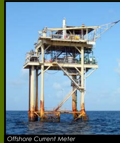
Offshore Current Meter