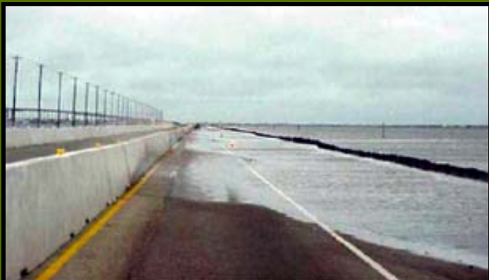
Water Level Predictions for Coastal Flooding

Two data collection platforms located in the Gulf of Mexico near Port Aransas measure wave and environmental parameters. The two platforms serve as prototypes for future platforms planned for the Texas Coast.