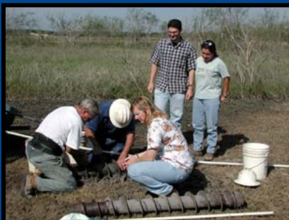
Installing ground water test wells

Current research at the Center is focused on several topics, artificial neural networks, creating three-dimensional visualization of subsurface freshwater resources, and modeling surface water quality. Artificial neural networks are being adapted to forecast water levels in aquifers and stream flows based on inputs such as previous precipitation and current aquifer water level or stream flow. Visualization of subsurface water quality and quantity is being developed in a geographic information system using geophysical data and based on a procedure developed by the Texas Commission on Environmental Quality Surface Casing Division. A non-point source loading model is being developed to help manage and understand high bacteria concentrations in a small watershed draining to Oso and Corpus Christi Bay.