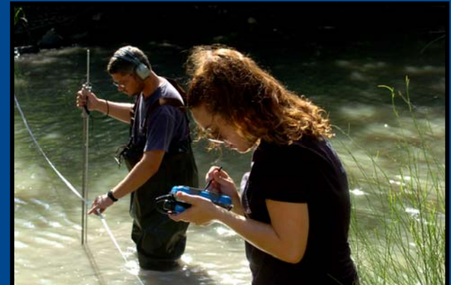
Gauging flow in Oso Creek

The Center is currently seeking funding for several new projects concerning a desalination test facility, coastal water resource issues, and other groundwater related subsurface investigations. Saltwater intrusion on groundwater resources is a coastal concern that becomes an issue with increasing water demands on coastal aquifers and as canal construction intersects the fresh water table aquifer. These concerns address both deep and groundwater exploration using magneto-telluric geophysical techniques to better define available water resources and to locate and monitor both shallow and deep saltwater intrusion. Other water resource issues are groundwater loss through phreatophytes and groundwater surface water interactions.