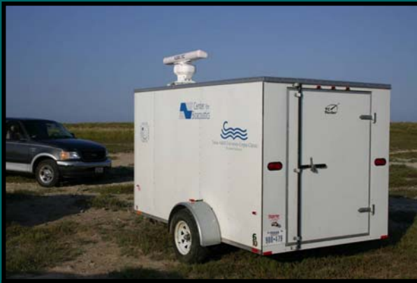
Radar Avian Trailer

Past research projects include studies of the effects of highway noise on endangered species, sonar systems of Amazon River dolphins, and the evaluation of industrial noise in the Gulf of Mexico. Recently, the Center's activities have expanded to radar and acoustic studies of the effects of wind farm development on migratory birds and the characterization of underwater background noise at harbors and ports.