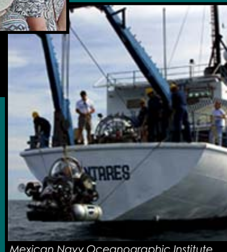
Mexican Navy Oceanographic Institute research vessel "Antares." submerses the "DeepWorker" mini-submersible.