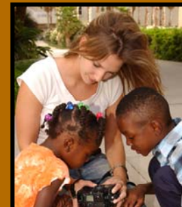
Photography student working with foster children as part of a service-learning project