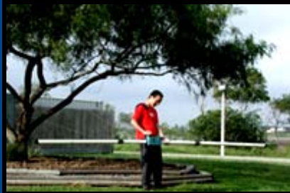
Conducting ground conductivity survey using an EM31.

The Center for Water Supply Studies at Texas A&M University - Corpus Christi was organized in 1991 to initiate cross-disciplinary research on water resources and other water related issues in South Texas. The Center focuses on research and education to develop professionals and leaders who can recognize and address water issues. Through active new research the Center provides information needed to evaluate alternative strategies for local and regional management of surface and subsurface water resources.