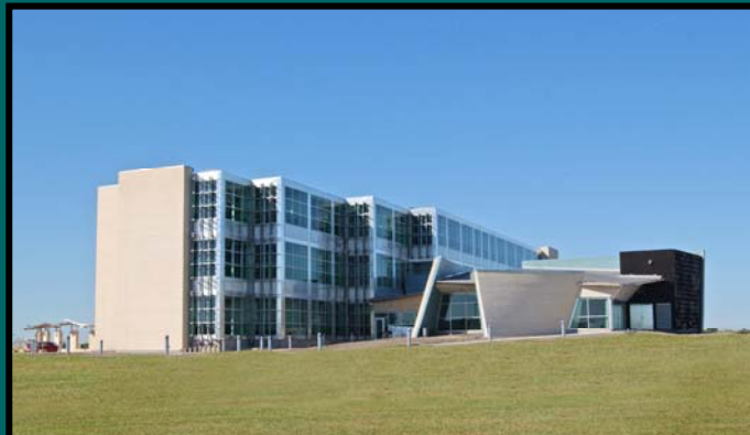
Harte Research Institute Building at Texas A&M University-Corpus Christi

HRI will sponsor a symposium on the State of the Gulf of Mexico every three to five years. This conference will engage scientists, natural resource managers, policy makers, businesses and industry, military, and all other stakeholders, as well as the general public, interested in the long-term sustainable use and conservation of the Gulf of Mexico.