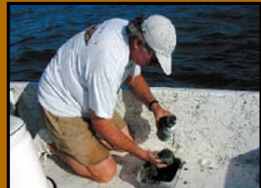
Processing sediments from the bottom of Laguna Madre.

Research in toxicology includes marine sediment analysis, effects of contaminants and environmental factors on behavior, growth, reproduction and survival of benthic organisms, and culturing test organisms.