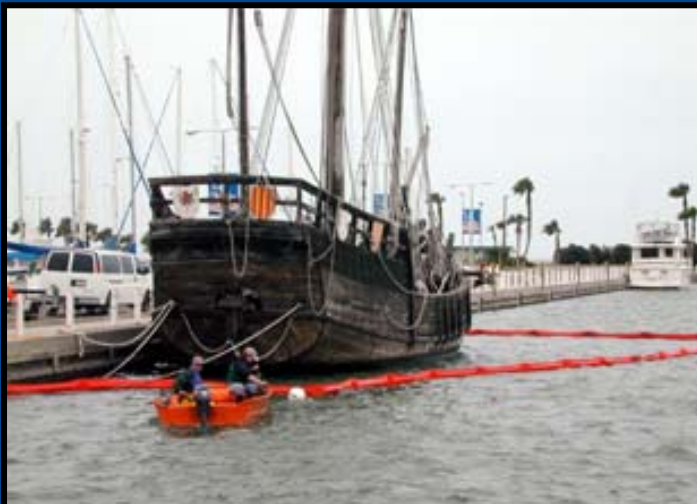
"Booming the Niña" in the Corpus Christi Marina

A Comprehensive Response Action Plan for Oil Spills was developed for the Port of Corpus Christi, Texas. It included identification of staging areas, resources at risk, and a booming and recovery scheme based on dominant wind and current patterns in the Port. The school assisted U.S. EPA Region VI in the development of an Integrated Electronic contingency plan now available through the Region VI website.