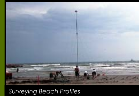
Surveying Beach Profiles

Academic instruction will lead to a professional career through our Geographic Information Science (GIS) Program. In addition to the instruction we have extensive programs of research for our students. Our program is nationally recognized as the top program in the country.