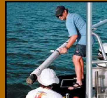
Taking a Core sample from the bottom of Laguna Madre.